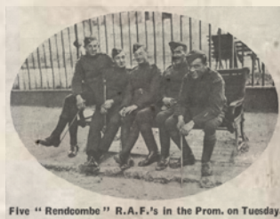
Five "Rendcombe" R.A.F.'s in the Prom, on Tuesday.